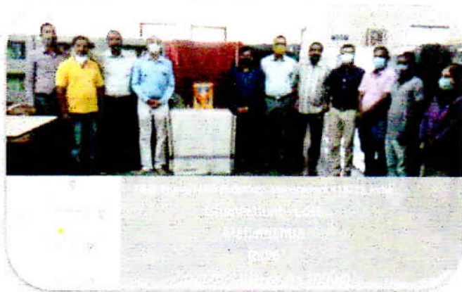
Caption 2 Everyone participated actively in celebration.