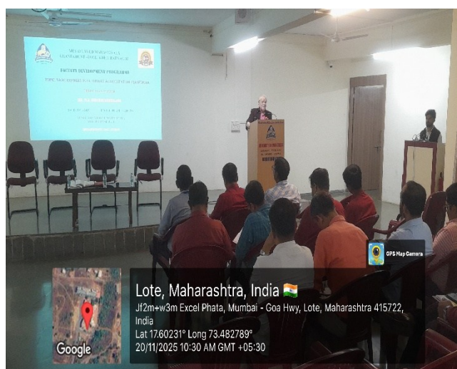
Speaker conducting lecture on NAAC Reforms 2024-Binary Accreditation Framework